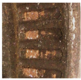
26 months, 32,789 miles without Webb LifeShield™ protection

Testing performed thru two winters in the Salt Belt